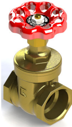
Fig: CG125B CG125N

CLASS 125 FORGED BRASS NON-RISING GATE VALVE